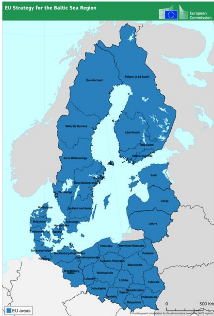
Annex 1: map of the EU Strategy for the Baltic Sea Region